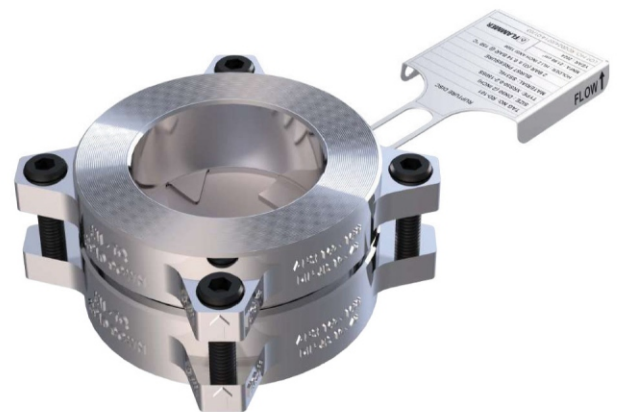
XRC Series disk mounts into HLI-TQ Series disc holder (refer to HLI-TQ Series data sheet)