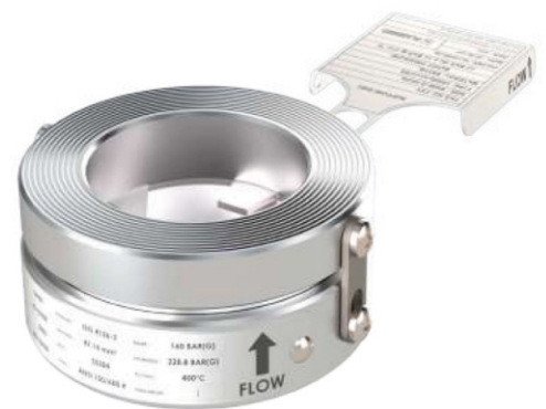
XRX Series disk mounts into HLI Series disk holder (refer to HLI Series data sheet)